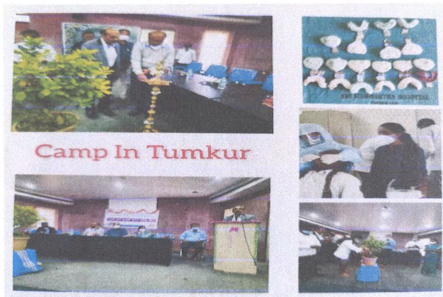
Camp In Tumkur

A total of 2 participants attended the course and gained the knowledge regarding the geriatric prosthodontics. Staff and PGs from the department of prosthodontics were present.